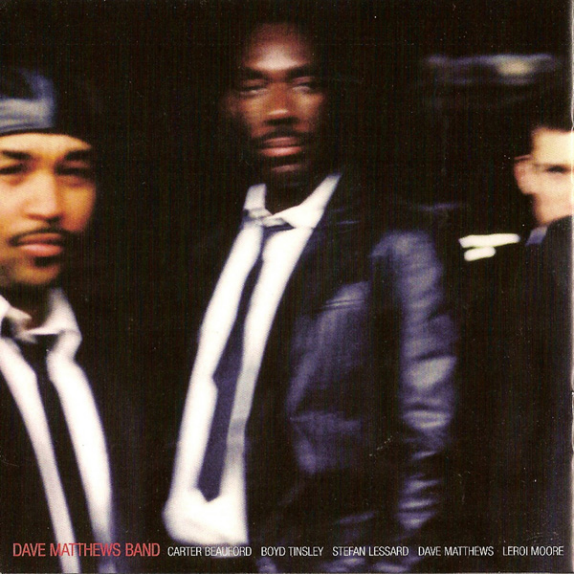
DAVE MATTHEWS BAND CARTER BEAUFORD BOYD TINSLEY STEFAN LESSARD DAVE MATTHEWS LEROI MOORE